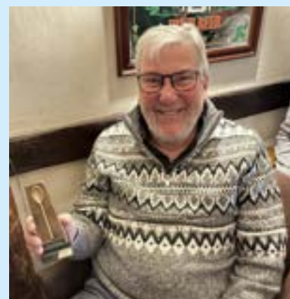
This year's Award winners in all their glory.