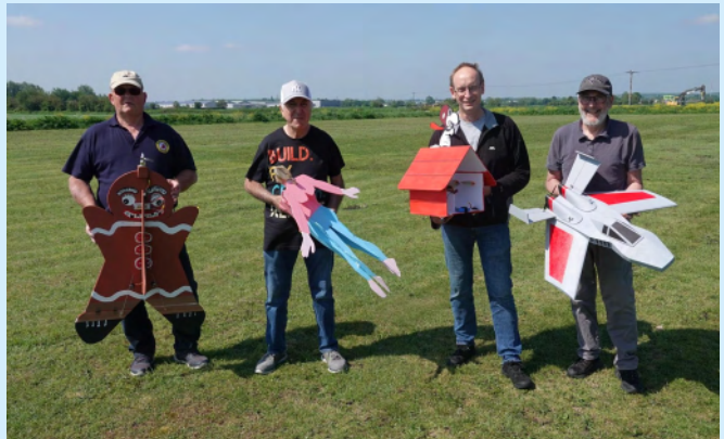
2024's Novelty Flying Machine Event.

Finally, for those interested in next May's Novelty Flying Machines Event, Some 'parameters' (not rules, nobody likes rules) were discussed at the meeting then re-discussed at the Field on Sunday. The emphasis is on building a novelty machine and making it fly. To assist with that, pre-event testing will be allowed as will multiple motors pointing in any direction you want. Multirotor based (flight control primarily from rotors) will not be allowed. The flight will be at least a controlled 'figure of eight' and a landing in the Field. There is still time for more discussion if you want.