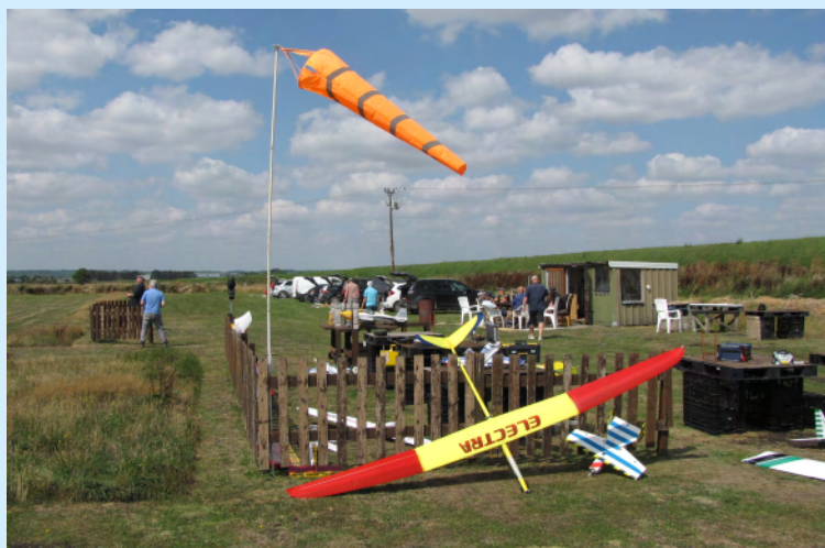
This photo was taken from the gate. Much further and I'd have been parked in the lane.