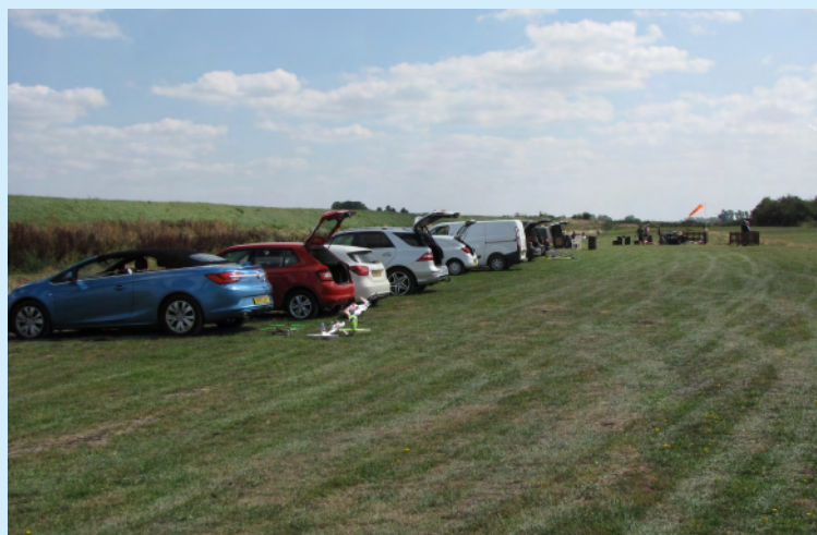
A busy day at the Club Field when the sun comes out and it's not too windy.