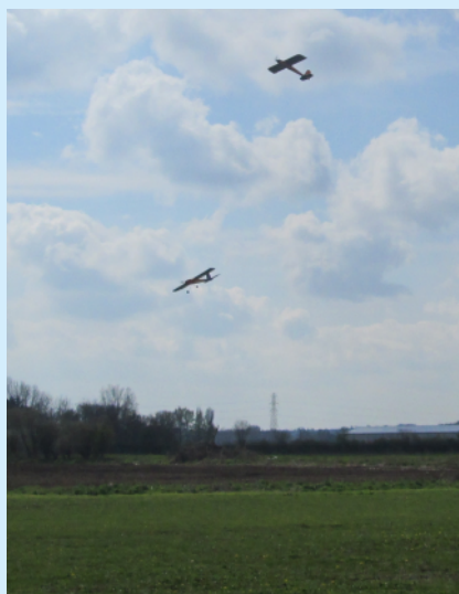
A bit of FunFly practising earlier in April.

As a side note to that, the Midland Area Fly-In will be held on Sunday the 9th July at Buckminster. This is usually a good day out so mark up your calendars now.