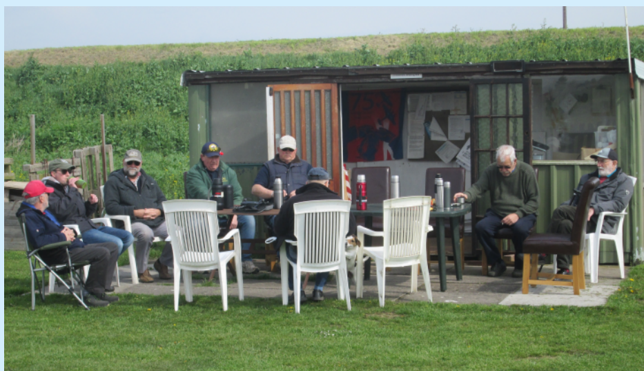
Eagerly awaiting the FunFly and Bomb Drop brief on the 30th. A full 90 degree crosswind made the day interesting