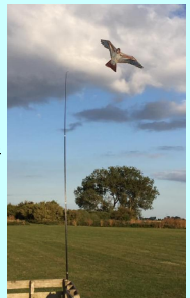
Eddie Junior in action.

Finally, please only put burnable items in the oil drum, as winter is not far off this will help to keep us warm. Also, our bird scarer, Eddie the Eagle, has been joined by the lighter Eddie Junior as a little back-up.