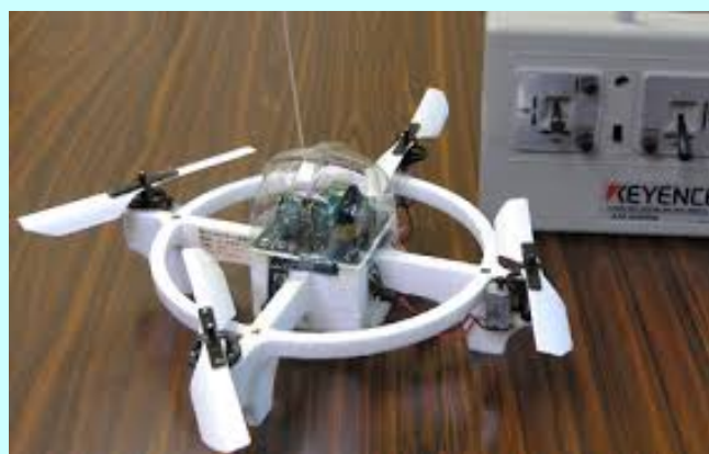
As for models, this is a GyroSaucer E-170. A Japanese model from 1989.

At this month's meeting, following the improvements made at the Field over the last year, some more have been suggested for the coming year. We will be looking to lay some more paving slabs in front of the mower shed, possibly with some hardcore and sand under them. There is still some scrap to get rid of and a yellow mower that needs some heavy duty repair if we wish to keep it. We also have a leak in the roof of the mower shed. The only task that doesn't have a plan at the moment is the paving slabs so, at some point, people will be required.