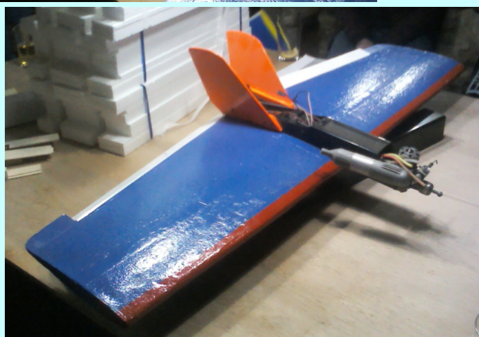
The finished article. Ready for a streamer out the back and some aerial mayhem.