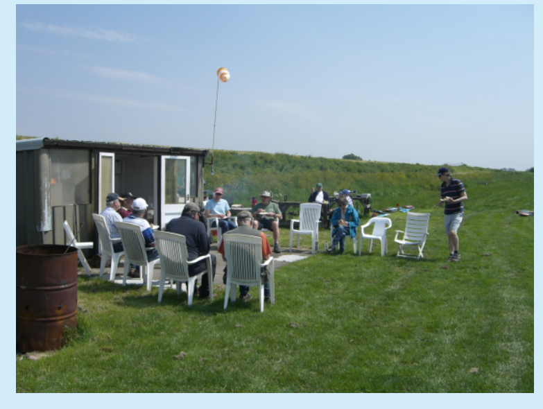
Everyone enjoying some lunch courtesy of our own masterchefs, Steve and Eddie.

Grass cutting was discussed again, our mower is on the way out and soon a Committee meeting will be held to assess the viability of buying a replacement, possibly a 'Finisher' rotary mower. Also it was suggested that a strip of long grass could be used as a demarcation line between the fly / no fly zones instead of cones, it may also provide a little protection from an errant model.