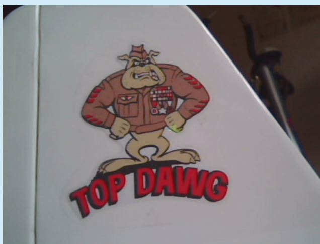
Top Dawg decal from the Top Flite kit

For those who haven't renewed their membership yet, here's a reminder with the current fees: